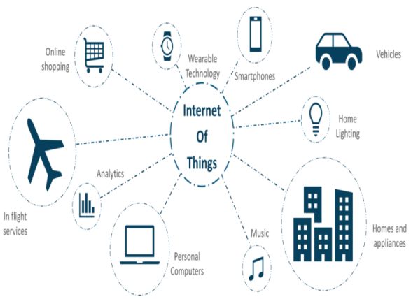
Figure 2: Internet of Things

The advances in IT cause it conceivable to structure a shrewd society in which devices to can discuss effectively with each other when associated with the Internet. Figure exhibits that in an IoT organize, anything's will prepared to pass on to the web at whatever point from wherever and offer organizations to anyone. Its application, for instance, sharp vehicle and the quick home, can give various organizations, for instance, alerts, security, imperativeness saving, computerization, correspondence, PCs and delight.