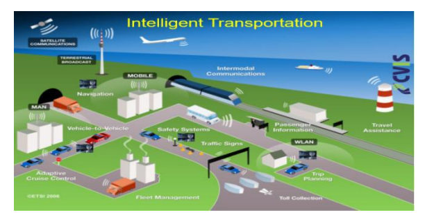
Figure 4: Application of IotIn Transportation

The IoT can assume the significant job in coordination of interchanges, control, and data handling crosswise over different transportation. Utilization of the IoT reaches out to all parts of transportation frameworks (for example the vehicle and the driver or client). Dynamic association between these segments of a vehicle framework empowers entomb and intra vehicular correspondence, savvy traffic control, shrewd leaving, electronic, calculated and armada the executives, vehicle control, and wellbeing and street help . Current cars are furnished with sensors which are associated with the web through control frameworks. A portion of the sensors utilized in autos with their positions are given in fig. IoT assumes significant job in street wellbeing frameworks. For example, crash recognition, path change cautioning, traffic sign control, insightful traffic planning as in fig.