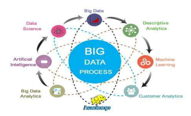
Fig1: Big Data Processing

Regular customer analysis systems are getting replaced by new structures arranged with Big Data developments. In these new structures, Big Data and basic language taking care of headways are being used to scrutinize and survey client responses.