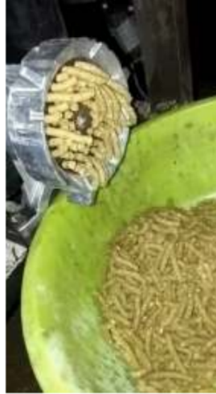
1 Figure 5. pellet making process as chicken feed