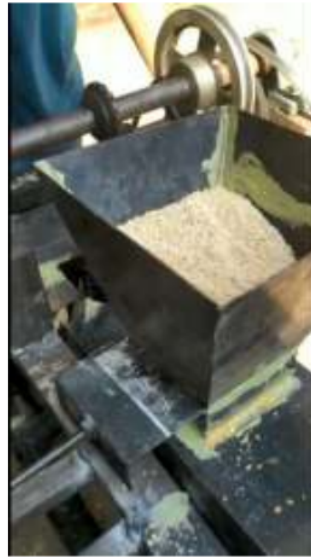
1 Figure 3. material funnel as a place to collect feed ingredients before mixing well