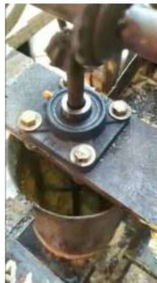
Figure 4. Mixing process