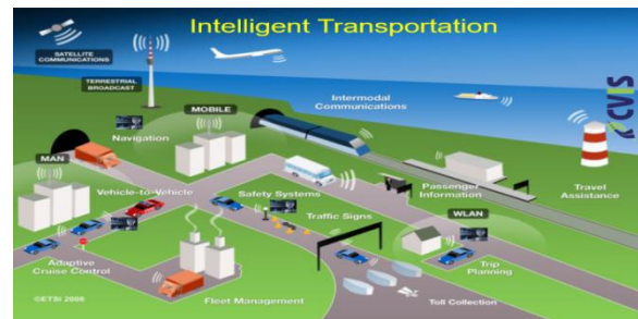
Figure 4: Application of IotIn Transportation

The IoT can assume the significant job in coordination of interchanges, control, and data handling crosswise over different transportation. Utilization of the IoT reaches out to all parts of transportation frameworks (for example the vehicle and the driver or client). Dynamic association between these segments of a vehicle framework empowers entomb and intra vehicular correspondence, savvy traffic control, shrewd leaving, electronic, calculated and armada the executives, vehicle control, and wellbeing and street help. Current cars are furnished with sensors which are associated with the web through control frameworks. A portion of the sensors utilized in autos with their positions are given in fig. IoT assumes significant job in street wellbeing frameworks. For example, crash recognition, path change cautioning, traffic sign control, insightful traffic planning as in fig.