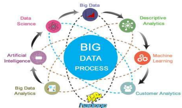
Fig1: Big Data Processing

Regular customer analysis systems are getting replaced by new structures arranged with Big Data developments. In these new structures, Big Data and basic language taking care of headways are being used to scrutinize and survey client responses.