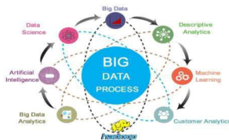
Fig1: Big Data Processing