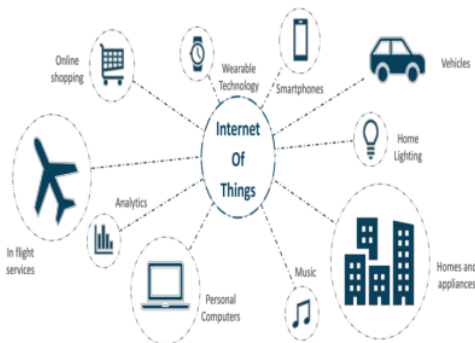
Figure 2: Internet of Things

The advances in IT cause it conceivable to structure a shrewd society in which devices to can discuss effectively with each other when associated with the Internet. Figure exhibits that in an IoT organize, anything's will prepared to pass on to the web at whatever point from wherever and offer organizations to anyone. Its application, for instance, sharp vehicle and the quick home, can give various organizations, for instance, alerts, security, imperativeness saving, computerization, correspondence, PCs and delight.