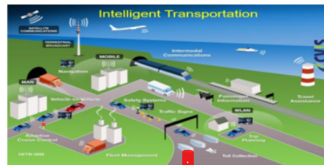
Figure 4: Application of IoT in Transportation

The IoT can assume the significant job in coordination of interchanges, control, and data handling crosswise over different transportation. Utilization of the IoT reaches out to all parts of transportation frameworks (for example the vehicle and the driver or client). Dynamic association between these segments of a vehicle framework empowers entomb and intra vehicular correspondence, savvy traffic control, shrewd leaving, electronic, calculated and armada the executives, vehicle control, and wellbeing and street help. Current cars are furnished with sensors which are associated with the web through control frameworks. A portion of the sensors utilized in autos with their positions are given in fig. IoT assumes significant job in street wellbeing frameworks. For example, crash recognition, path change cautioning, traffic sign control, insightful traffic planning as in fig.